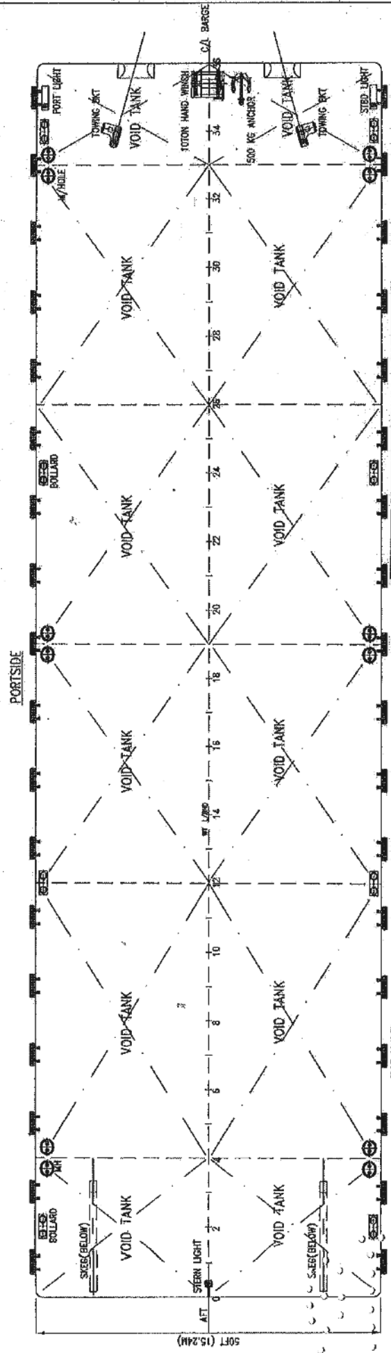
MAIN DECK PLAN